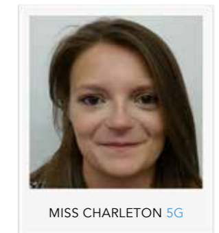
MISS CHARLETON 5G