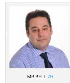
MR BELL 7H

Students spend each day from 8.30am until 8.45am with their form and their Form Tutor. Students can approach their Form Tutors with any concerns or problems they may have. Form Tutors also monitor students' attendance, behaviour and homework diaries and will be in touch with you if they have any concerns.